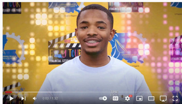
2021 F.L.Y. Tour Highlights

Postsecondary administrators and presidents also met with students in breakout rooms to discuss financial aid options, majors, and more.